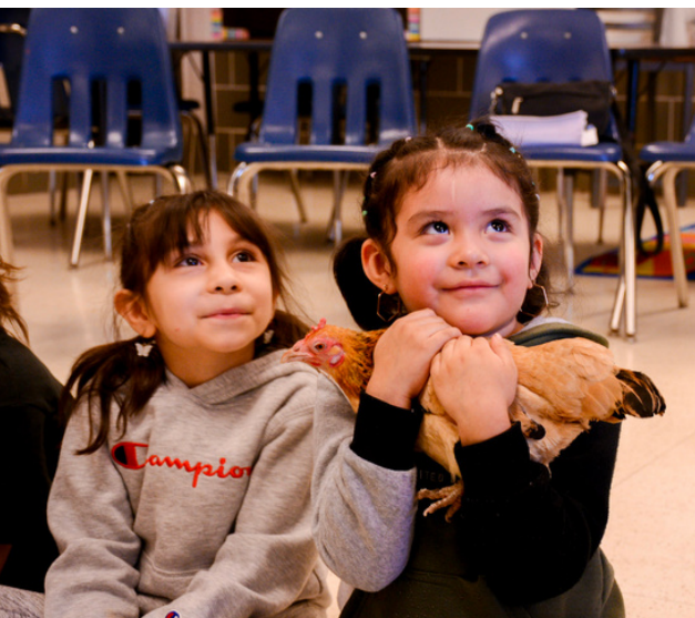
Left: Vista View Elementary School students learning about chickens. Right: Green Seniors participants walking through Dodge's woods.