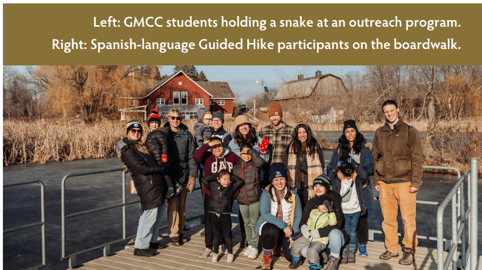
Left: GMCC students holding a snake at an outreach program. Right: Spanish-language Guided Hike participants on the boardwalk.