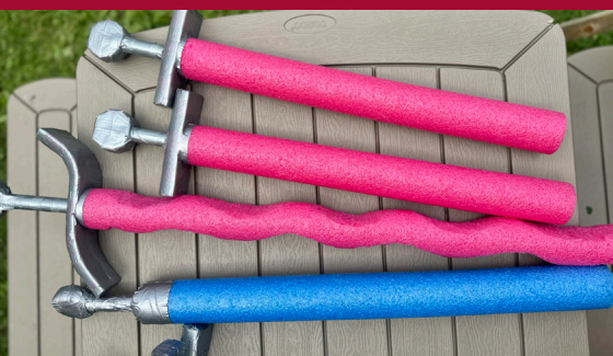
Left: Pool noodle and duct tape swords crafted by summer campers laying on a picnic table between battles. Middle: Campers Amrita (left) and Eleanor (right) enjoying freeze pops after a full day of play. Right: Campers chasing each other in a swordplay game.

Send your school-age child to camp at Dodge! Explore our camp offerings at DodgeNatureCenter.org/Camps .