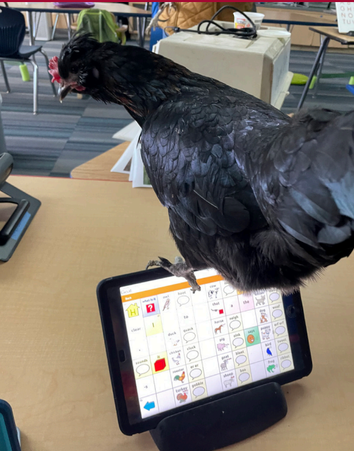
Michael leading a group of students outdoors at Crestview Elementary School in Cottage Grove. A chicken sitting on a student’s communication device in Sara Gokey’s classroom during a visit from Pam.

Connect more kids to nature! $10 sends a student on a field trip; $250 funds an outreach program. Give online at DodgeNatureCenter.org/Donate .